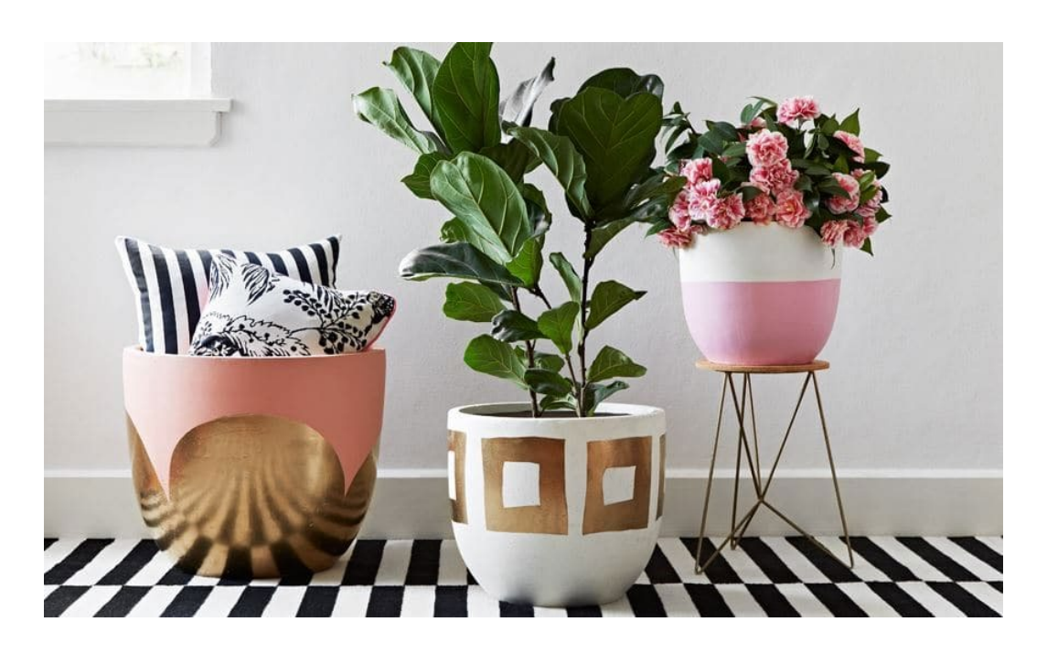
Designer glass or ceramic planters fit perfectly in a modern decor.