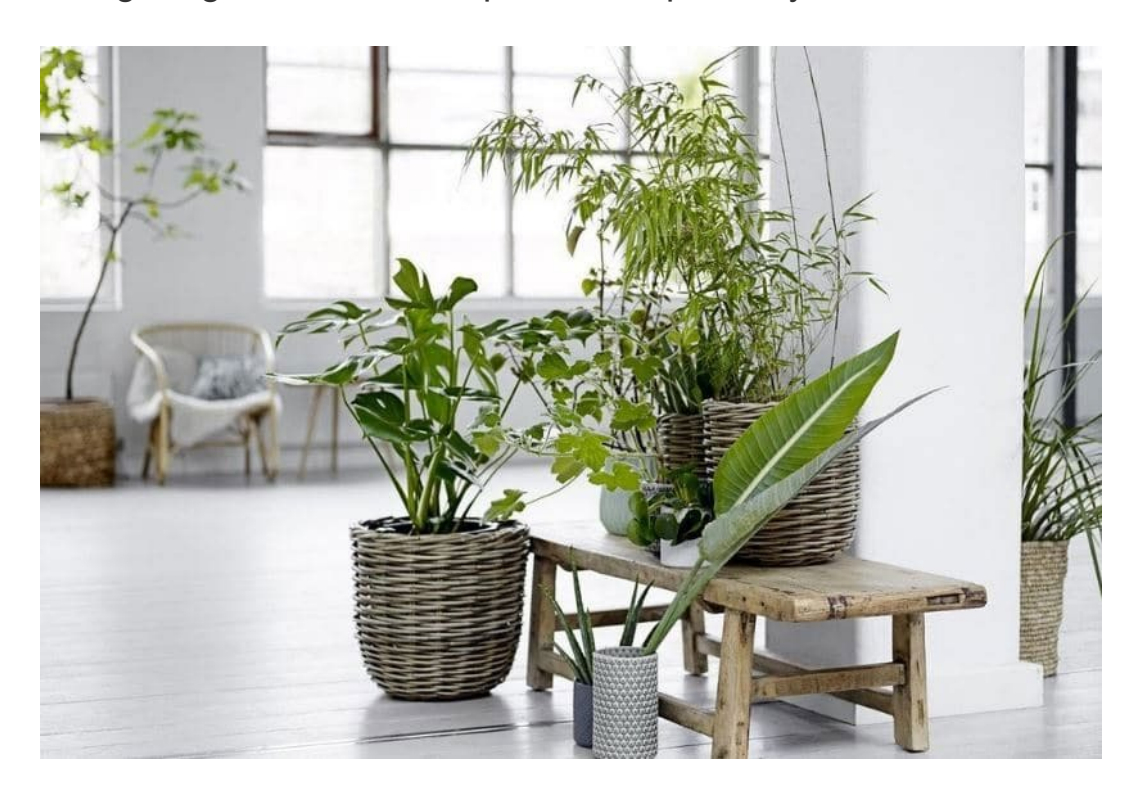
The flowerpots in rustic decoration combine perfectly (you can even place wicker baskets).